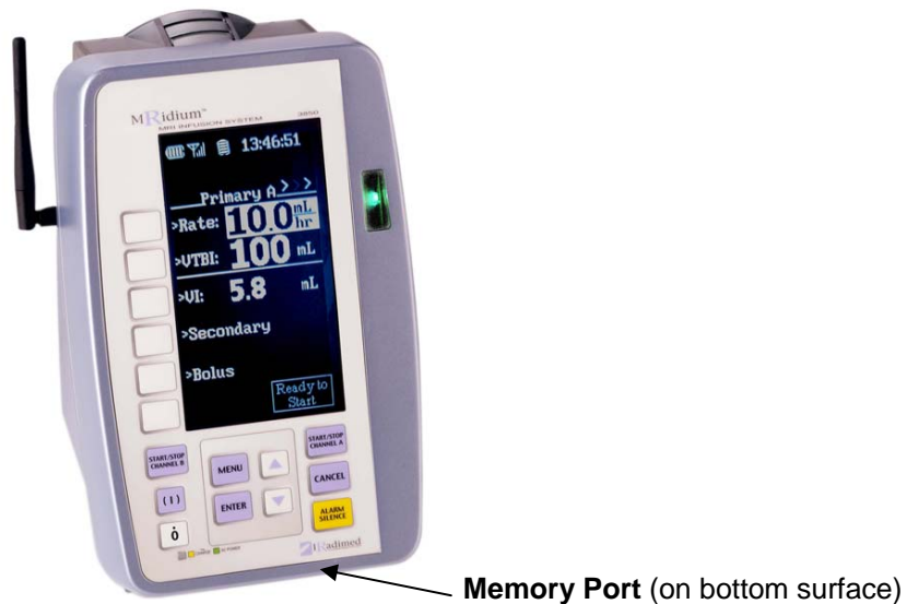
Remote Display 3855 Front View